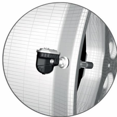
Tire pressure monitoring system (TPMS).

The global conquest of tire pressure monitoring systems began ten years ago in the US, when installation of the systems in new vehicles became mandatory. Europe followed in November 2014, and now even South Korean legislators are requiring the systems. China, by now the world's largest auto market, will presumably be next. The technical standards were already put into place in the country in 2011. However, the corresponding sanctions are still missing, which is the reason why only the top vehicle classes are currently being equipped with tire pressure monitoring systems there. Until more penetration occurs for new vehicles, Schrader will continue furthering the democratization of TPMSes. Thus, the company now offers three practical retrofitting kits in OE quality especially for China. Of course, laser welding systems "Made in Germany" are also used in these sensors.