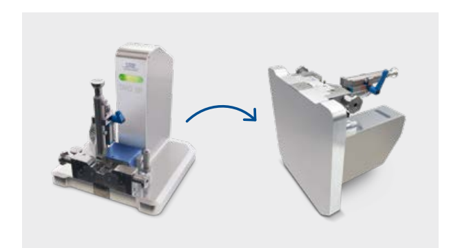
Two operation positions possible for different sizes of parts

LPKF Laser & Electronics SE (Headquarters)