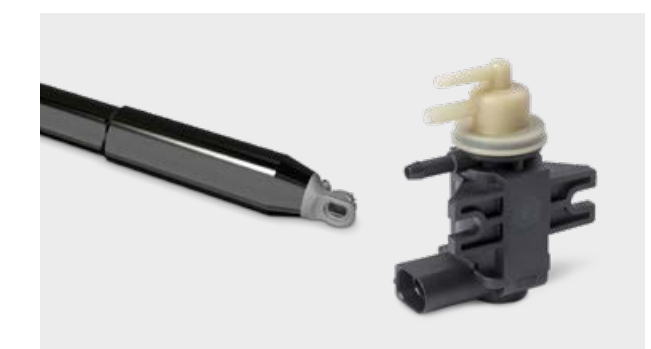
Cylindrical parts, i.e. for automotive applications